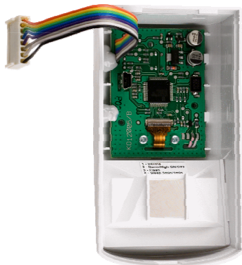
JA-84P wireless motion detector with built-in camera